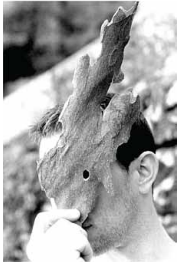
Michael Schumacher

www.varia-impro.se Registration workshop; workshop@varia-impro.se